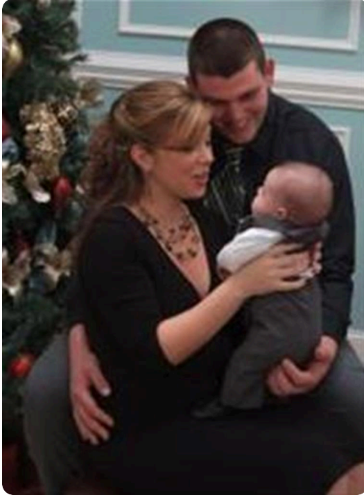
We Love You Granny!